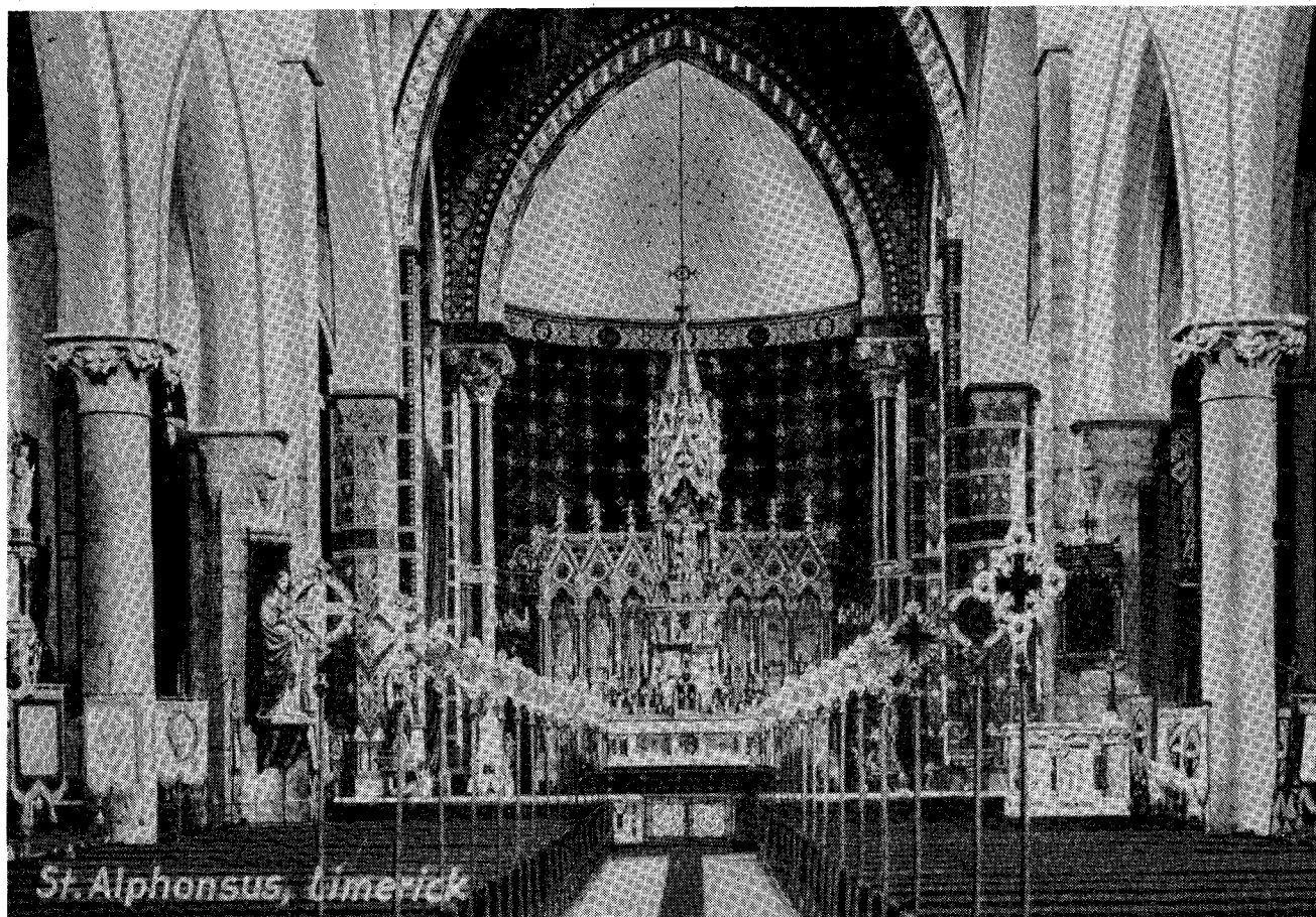
St. Alphonsus, Limerick